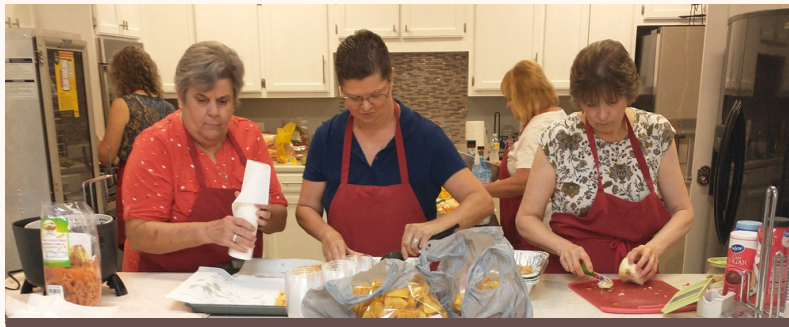
The food team was too busy to pose for a picture!